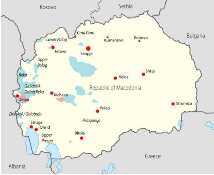
Map 1. Geographical dispersion of Macedonians of Islamic religion in the Republic of Macedonia

For a better understanding of the geographical dispersion of this population in the Republic of Macedonia and in the neighbouring region, the researcher includes this map, based on Sharevski's research<sup>19</sup>: