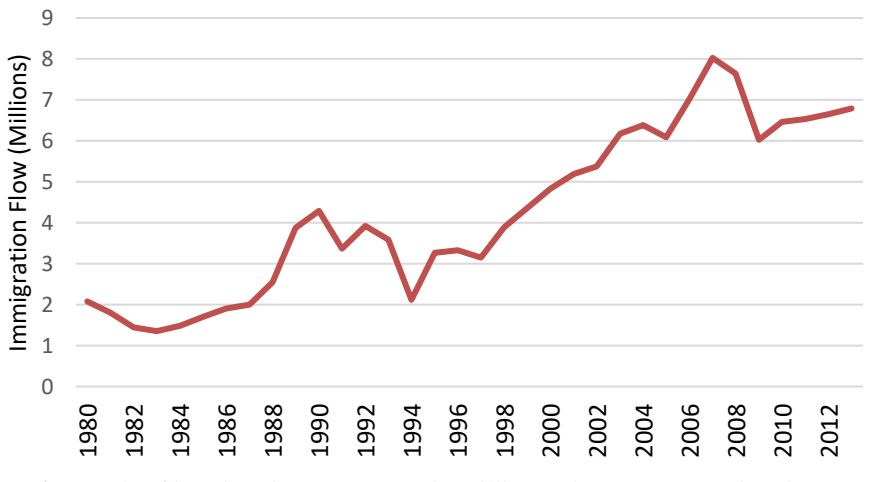
Figure 1. Trends of immigration to Europe (in millions) since 1980 ( Modified after: UN , 2015a).

The origin of terrorism in Europe goes back to the large-scale immigration into the old continent, which started in the early 1950s, in the aftermath of the Second World War when many European colonials lost their world power, causing large population movements from the lost colonies toward their mother country (de la Rica et al. , 2013). This phenomenon has been on a continuous increase ( Figure 1 ), making Europe a major destination of world immigration. Along with the overall increase of immigrants in Europe, Muslim populations constituted most of immigration flow mainly from Africa, the Middle East, and Asia (Leiken, 2005). The number of Muslims in Europe has grown from 29.6 million in 1990 (4.1% of the population) to 44.1 million in 2010, representing around 6% of the total European population. The number of the European Muslim population is projected to grow at an average annual growth rate of 1.5%, which is about twice the rate of the non-Muslim population over the next two decades (PRC, 2011).