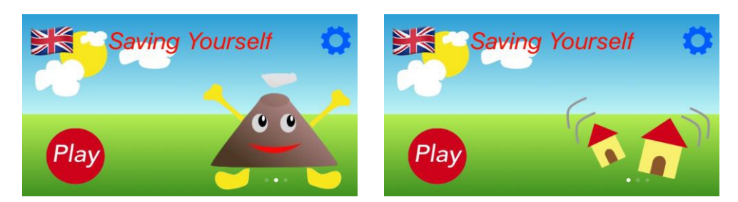
Figure 1. Saving Yourself versions for volcanological and seismological emergency.

From the methodological experience of Learning on Gaming, derives an App to improve Earth's Sciences, particularly Geophysics, and above all to improve environmental and safety education (Fig. 1).