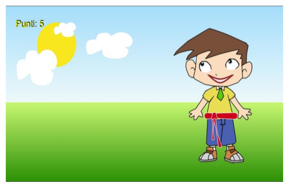
Figure 3. Another engage element is multiple game levels, with different prizes: a green belt, a red belt, a blue belt, a safety star.