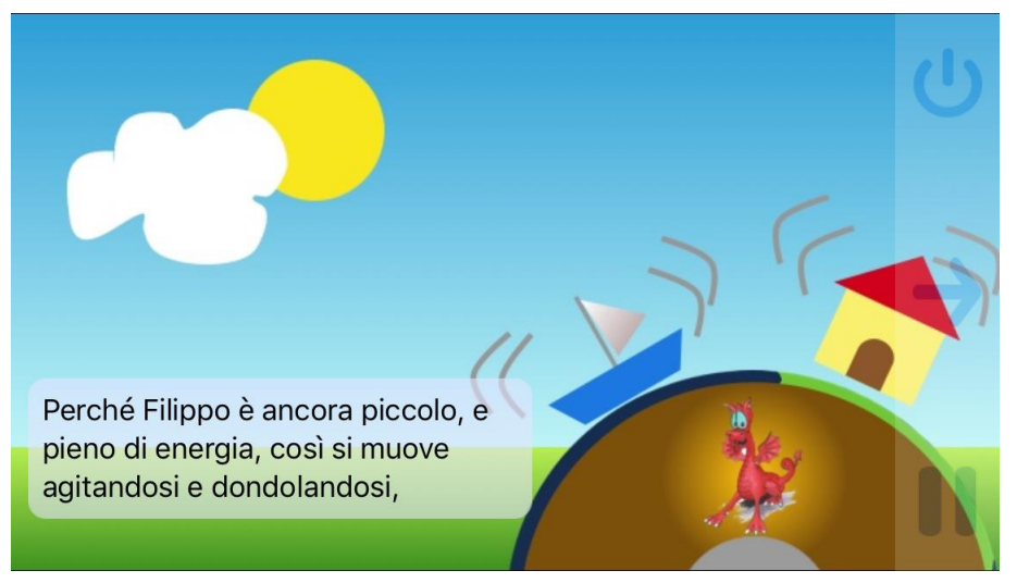
Figure 2. Methodology is storytelling, gaming, use of information and communication technologies, innovative teaching.

All Saving yourself apps are enriched with original designs, suitable for the