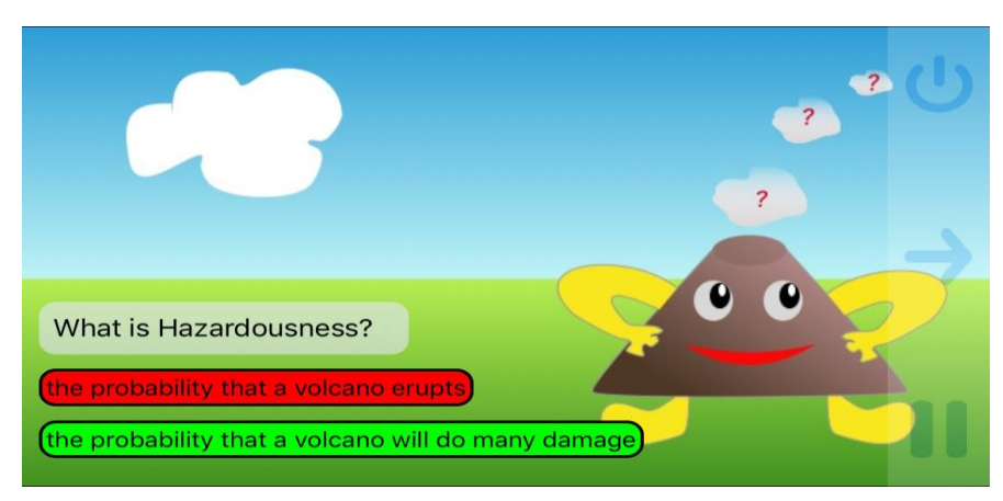
Figure 4. Immediate feedback: wrong answer is indicated in red, while the correct answer appears in green.

With GIFs, the geophysical mechanisms are clarified (Fig. 5), so it is easier to defeat frequent misunderstandings. In particular earthquake version aims to get aware and responsible informations, to avoid panic, to keep a healthy caution.