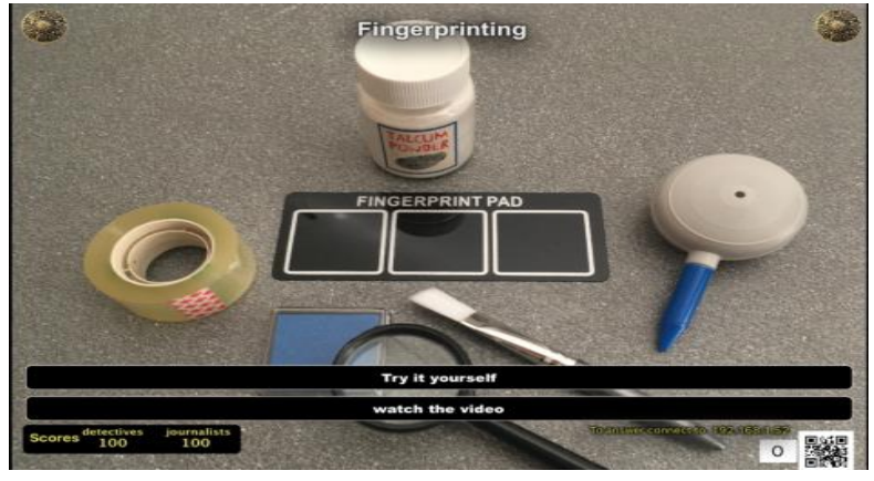
Figure 1: Screenshot of one CrimeQuest page regarding a hands on activities (fingerprint detection).

CLIL works with meaningful, challenging and authentic context that CLIL works with meaningful, challenging and authentic context that can motivate learners much more than traditional approach. Real world contexts engage students because they provide suitable learning environments for problem-based learning. CLIL scaffolding reinforces students' learning. They need scaffolding (Böttger, H., Meyer O., 2008) in order to improve language. Scaffolding is a powerful teaching tool; in fact facilitates students in understanding the content and the language in the task and enables learners to complete exercises by providing correct supportive structures. Scaffolding, besides, supports the enrichment of specific vocabulary and entire phrase construction by providing motivation, enthusiasm and language proficiency enhancing skills. It promotes the interaction between learners that begins to communicate with each other in an authentic way, stimulating thinking skills together with a specific topic glossary. The resulting outputs consist in enhancing fluency in communication and in increasing self esteem. communication and in increasing self esteem.