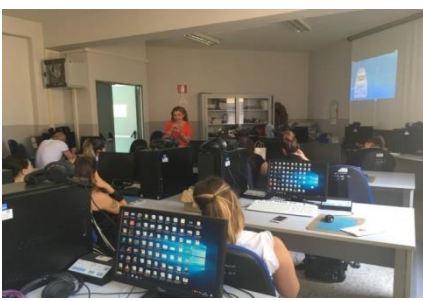
Figure 3 A whole class following the game with an IWB

The game can be played in a laboratory to accomplish one or more hands-on activities or in a classroom simulating a workshop activity.