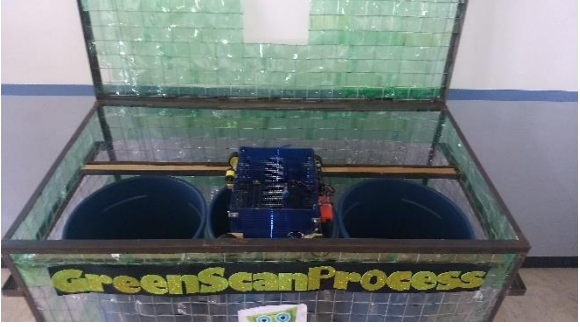
Figure 4. Prototype example.

Development: It refers to the lifting of requirements and the system model (Madariaga, Rivero & Leyva, 2016). An investigation of the properties of the objects was carried out, which will be used for their identification and classification. Thus, it makes use of the different types of correct sensors that are capable of recognizing their individual properties. A diagram of the phases of the process (container states, detection of the sensors, location of the container on the boats, etc.) was also elaborated, optimizing the tasks that are redundant and thus obtaining a maximum performance, and obtaining results in a minimum time to pass for each cycle of this process (for each object classification). Figure 4 represents an example of the prototype of the project.