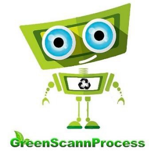
Figure 3. Example of project image