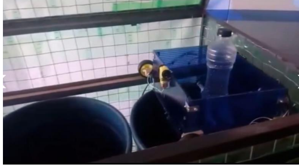
Figure 5. Example of project operation

To perform the performance tests, GreenScannProcess was applied in developing a software with a new technology called Raspberry pi 3. Basically, 3 types of sensors were used: The weight sensor will determine that there is an object in the container that we need to classify; the humidity sensor to identify organic waste; and another sensor to identify recyclable inorganic materials. A cart was developed that contains the system installed, and is able to move in the container in order to classify and deposit the waste in the corresponding boat. Figure 5 represents an example of the operation of the project.