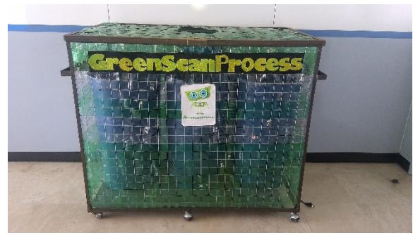
Figure 6. Prototype finished.

Delivery: This phase is characterized by the finished prototype. The duration of the project was 16 weeks. Figure 6 represents the finished prototype.