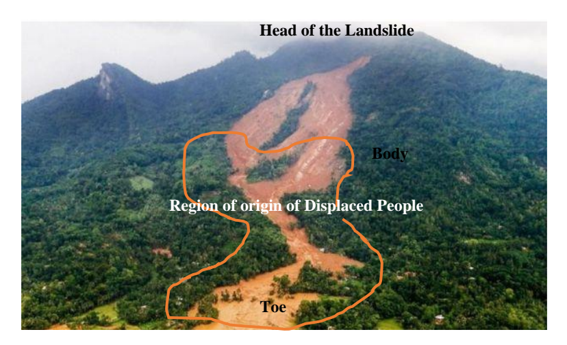
Fig 1: Location of Samasarakanda Landslide