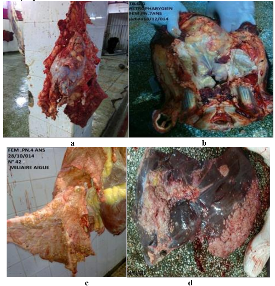
Photo 1: Tuberculous lesions in different organs of cattle in Doukkala area. a-Heart (pericardium), b-Retropharyngeal nodes c-Lungs, d-Liver

The majority of the macroscopic lesions observed on tuberculous bovine carcasses were detected at the level of the ribcage (44.83%) and concerned the lungs and bronchial lymph nodes, as well as at the level of the head, mainly in the retro-pharyngeal lymph nodes (42.32%) and also the liver and its lymph nodes (Table 5 and Photo 1).